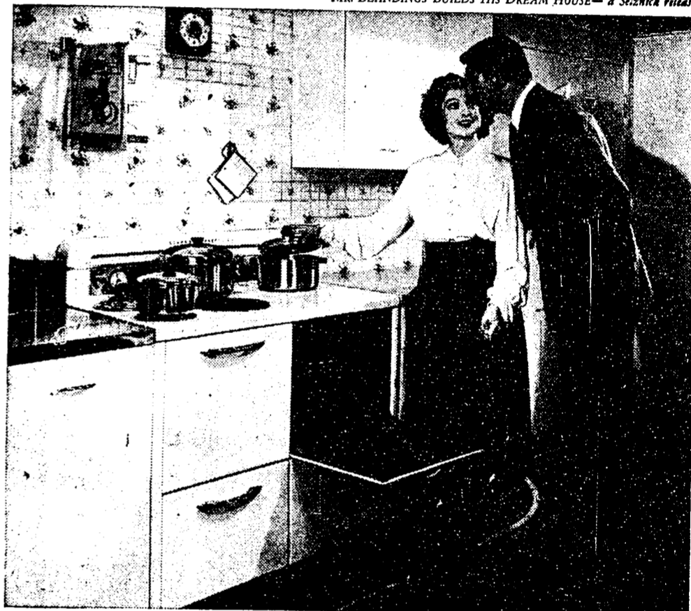
Cary Grant and Myrna Loy as Mr. and Mrs. Blandings in R.K.O.'s MR. BLANDINGS BUILDS HIS DREAM HOUSE — a Seiznick release

1. Mr. Blandings: Hello, Dear, what are you dreaming up for dinner in this bright little workshop? Mrs. Blandings: See for yourself, Nosey. But the best part of the dream is the way my "Unseen Friend" lends a hand. Mr. B: Your "Unseen Friend?" Who do you mean... anybody I know?